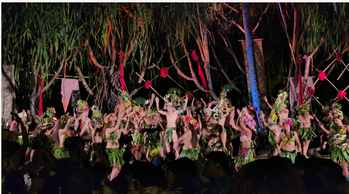
'Ori Tahiti, the traditional dance