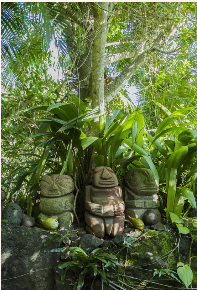
Tiki, Half-man, half-god, the Tiki symbolizes a mythical character